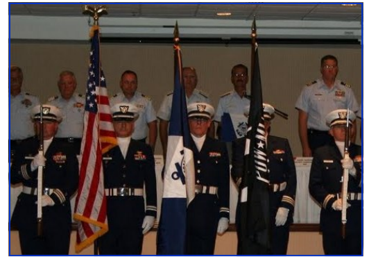
A Color Guard presents the colors at the opening of the Fall Conference in Branson.

Training, awards and fellowship are at the center of the district's fall conference, which was held in Branson this year. The 8th Western Rivers District of the Coast Guard Auxiliary holds a spring and a fall conference every year at different locations across the district. With the fall conference in Branson, it was a unique location for fellowship and entertainment.