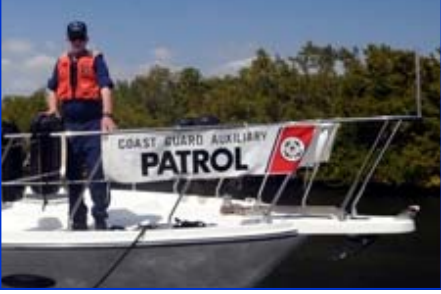
Gene Kellogg In Florida