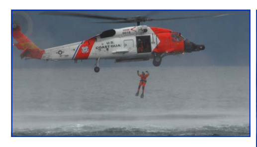
A Swimmer Enters The Water