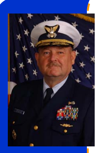
Admiral Thad Allen USCG Commandant