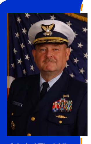
Admiral Thad Allen USCG Commandant Official CG Photo